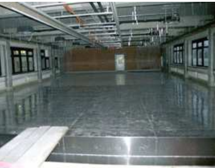
Large-area screening of an office building against a lower level transformer station using Aaronia Magnoshield® screening panels.